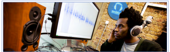
SoundSign for music and entertainment